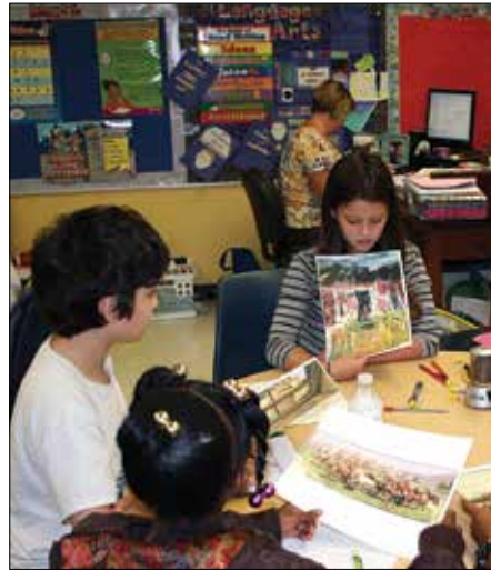
Students working on a poetry project during an outreach visit by a Morris educator.

Stay up-to-date with all of the Morris's programs with eConnections , our electronic newsletter just for educators. Register at www.themorris.org or send your name and e-mail address (personal e-mail preferred) to education@themorris.org .