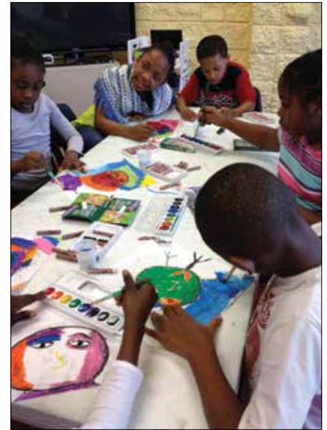
Kids enjoying an art activity.

Let us help you create a unique tour experience that meets the needs and interests of your students. Enjoy in-depth gallery talks about changing exhibitions, highlights from the permanent collection, aesthetics, or the business of museums. Optional hands-on activities available. Have your own idea? Just give us a call!